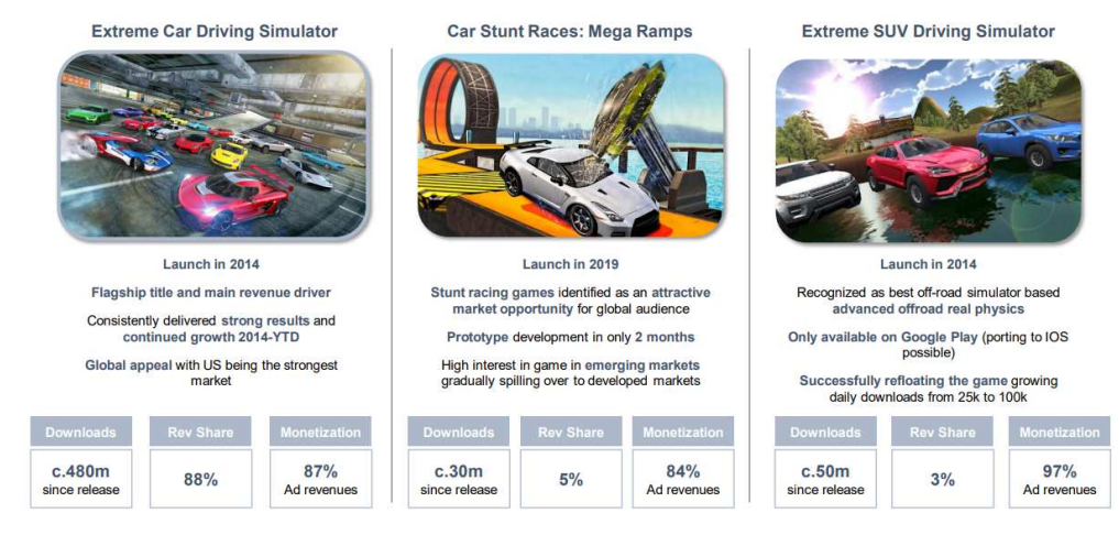
Figure 1: Racing games portfolio